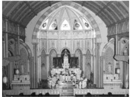
Current Church—built 1902, circa early 1900s