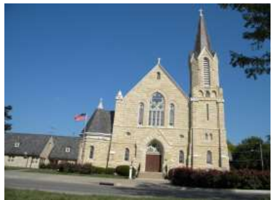
Current Church—built 1902, current pic