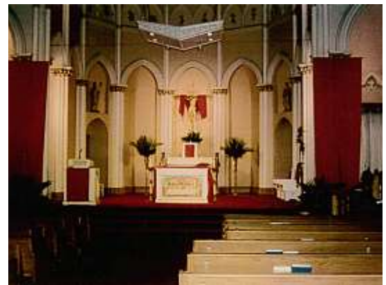
Current Church—built 1902, circa 1980s