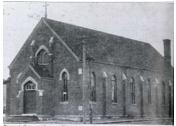
Red Brick Church—built 1883

The makeup of the congregation is as diverse as its history. Originally built by Irish immigrants and home to their children, grandchildren and great grandchildren, St. Patrick's continues to be home to a thriving immigrant community. Many of the current congregants hail from Latin America - Mexico, Guatemala, El Salvador, Costa Rica etc.