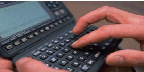
Performance Based Activities provide data for better instruction.

Grade Level: Kindergarten Diocese of Des Moines – Progress Report Core Courses